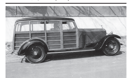
1927 ROLLS ROYCE WOODY