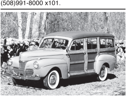
1941 FORD WOODY Great shape. $75,000. Will finance